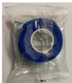
Photo 1 --- Nonsterile Self-adhesive Bandages in foil bag