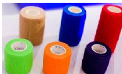
Photo 2 --- Nonsterile Self-adhesive