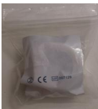
Photo 1 --- Non-woven Adhesive Tapes in PE bag