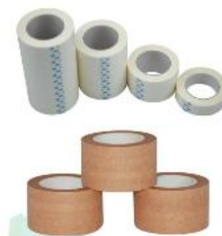
Photo 2 ---Non-woven Adhesive Tapes