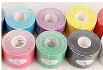
Photo 1 --- Sports Adhesive Tape in PE bag