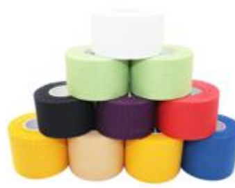
Photo 2 --- Sports Adhesive Tape