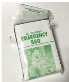
Photo 1 --- Emergency Blanket in PE bag