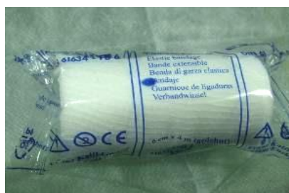
Photo 1 --- Nonsterile Elastic Bandages in foil bag