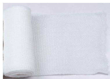
Photo 2 --- Nonsterile Elastic Bandages