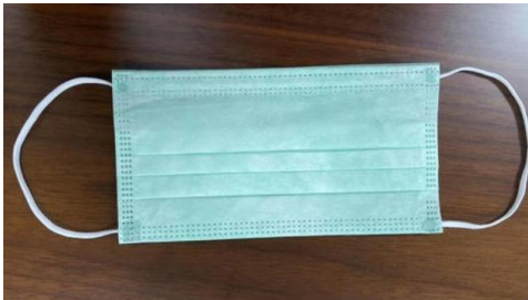
Photo 1 --- Ear Loops Non-woven Face Mask