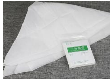
Photo 2 --- Non-woven Triangular Bandages