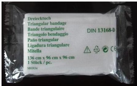
Photo 1 --- Non-woven Triangular Bandages in foil bag